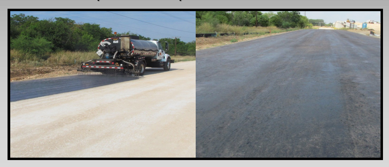
TERRA-PRIME™ , an excellent, environmentally friendly alternative to asphalt prime coats.

TERRA PRIME was invented at the University of Texas at Austin (UT-Austin), and it offers